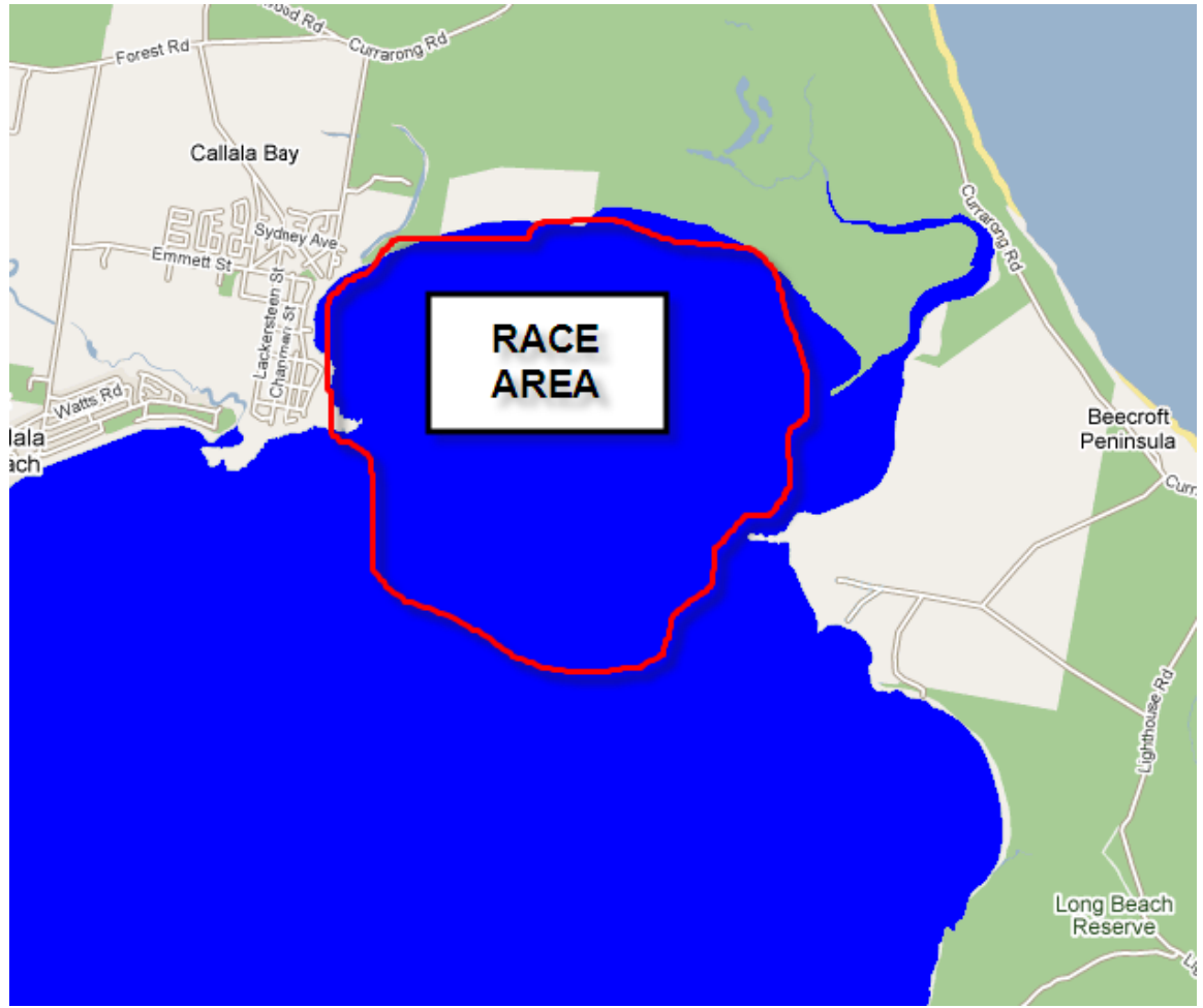
Page 8 of 8, JBSC October 2020 NOR – V1 7/7/2020